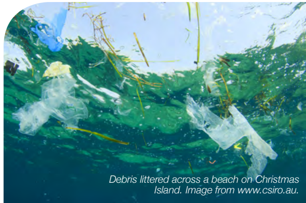
Debris littered across a beach on Christmas Island.