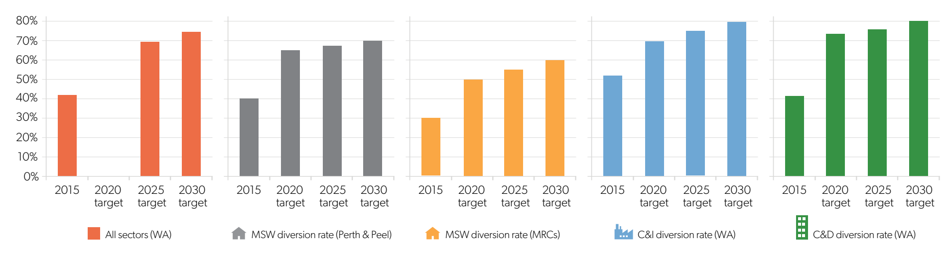
Figure 2: Material recovery performance in 2015–16 and waste strategy targets for 2020, 2025 and 2030 (ASK Waste Management 2017)

The journey to becoming a circular economy will not be easy and, as shown in Figure 2, there is a substantial gap between our current performance and the performance required to achieve our waste generation and material recovery targets.