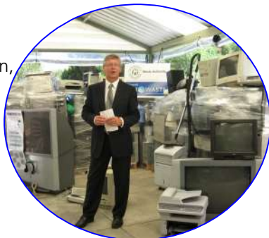
The Hon Bill Marmion, MLA, Minister for Environment, launches WATEP

The Authority provided $400,000 to support interim e-waste collections from metropolitan and non-metropolitan areas while the work of the E-Waste Committee was carried out. The interim e-waste program recovered 688 tonnes (390 tonnes metro; 298 tonnes non-metro).