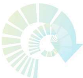
Westonia - winner of the 2010 Tidy Towns Sustainable Communities Category with KABC.

There was a high level of participation in KABC WA community pride programs in 2010 with 336 category entries in the Tidy Towns Sustainable Communities (won by Westonia), 42 category entries for Clean Beach Awards (won by Rockingham) and 48 category entries for Sustainable Cities (won by City of Stirling).