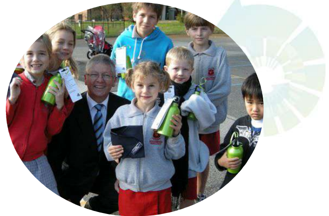
The Minister congratulates Hollywood Primary students as they receive awards for a competition through the Waste