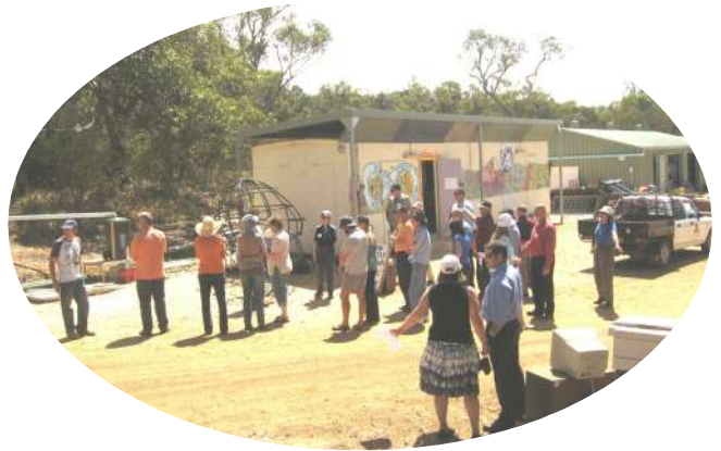
Denmark's Tipshop - Transforming Trash seminar

It states that DEC is an equal opportunity employer and encourages Indigenous Australians, young people, people with disabilities, people from culturally diverse backgrounds and women to apply for positions within the agency. It also promotes flexible working arrangements.